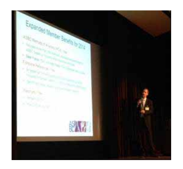
Presentation by the President of ASBC

The agreement "DECLARATION OF COOPERATION BETWEEN BCOJ & ASBC" that was first executed in 1994, was renewed and signed by both ASBC and BCOJ Presidents.