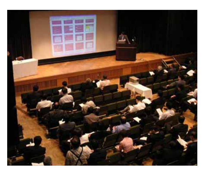
Presentation in the Annual Meeting