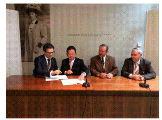
Ceremony marking the partnership agreement with the EBC

BCOJ board members participated in the 36<sup>th</sup> EBC Congress held from May 13 to 17, 2017, in Ljubljana, Slovenia, to promote technology exchanges with participants and EBC board members. During the conference, a short ceremony was held to mark the partnership agreement between the BCOJ and the EBC.