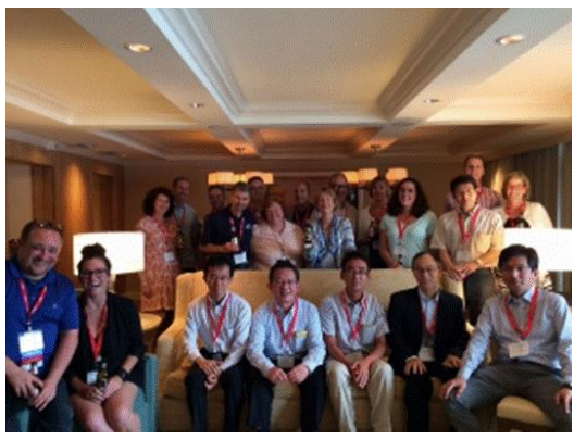
Reception party held by the ASBC president

BCOJ board members participated in the ASBC annual meeting held from June 4 to 7, 2017, in Fort Myers, Florida, USA, to promote technology exchanges with participants and ASBC board members. During the conference, 20 cases of Japanese beer were donated and served to delegates. BCOJ members were invited to the reception held by the ASBC president and networks among delegates were established.